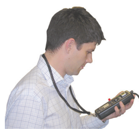
Take the reading