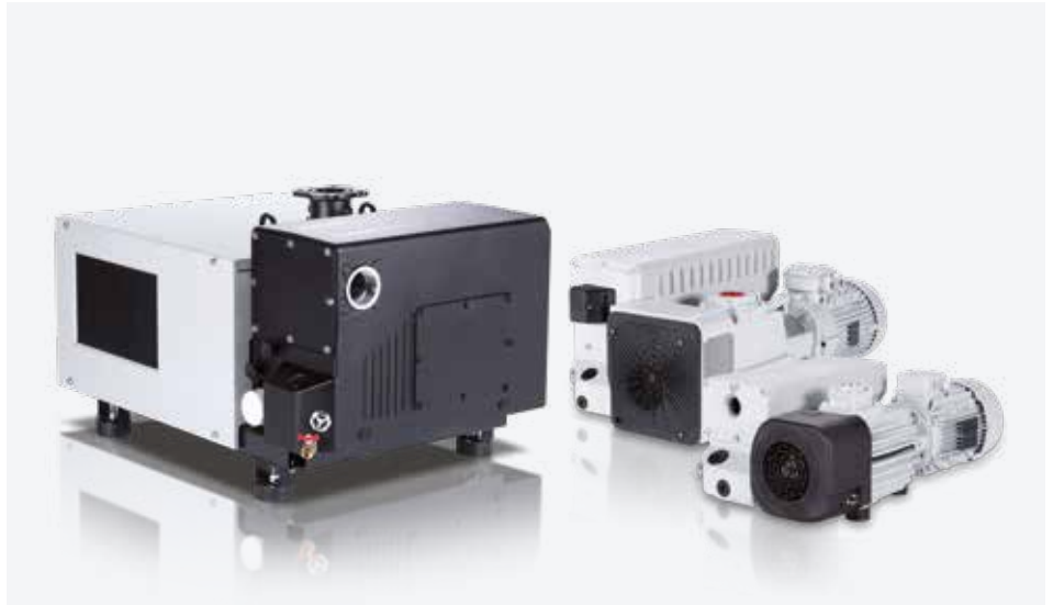
Typical SOGEVAC B models

Please refer to the full application listing matrix on page 4.