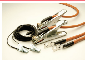
6220-755 5m Lead set (600 A)

2 x 50 mm 2 current leads with clamps and 2 x potential leads with clips.