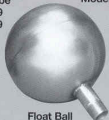
Float Ball Accessory