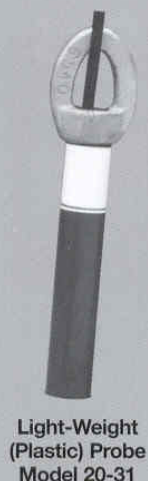
Light-Weight (Plastic) Probe Model 20-31