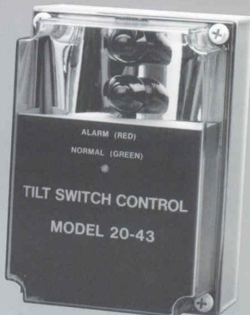
Control Unit Model 20-43