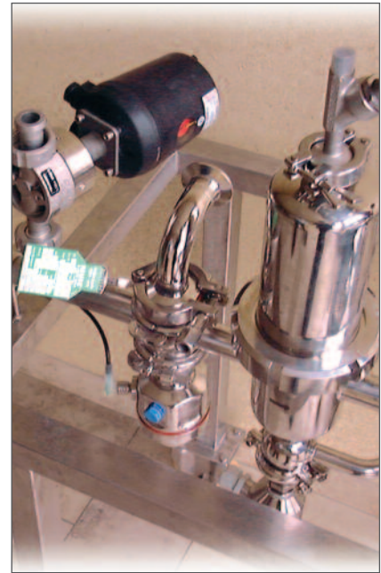
TC(R)-KUB® in test facility

The signalling function corresponds to that one of the opening dry contact. In case of bursting the TC(R)-KUB® reverse acting buckling pin disc resp. if dynamic pressure is sensed the electrical intrinsically safe closed circuit is interrupted. This interruption in the closed circuit can be used by means of an approved isolated switch amplifier with relay output or the like for signalling and/or process controlling.